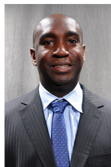
Head Coach 2nd Season Cal Poly State '90