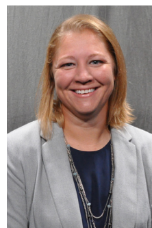
Associate Head Coach 2nd Season Green Mountain '99